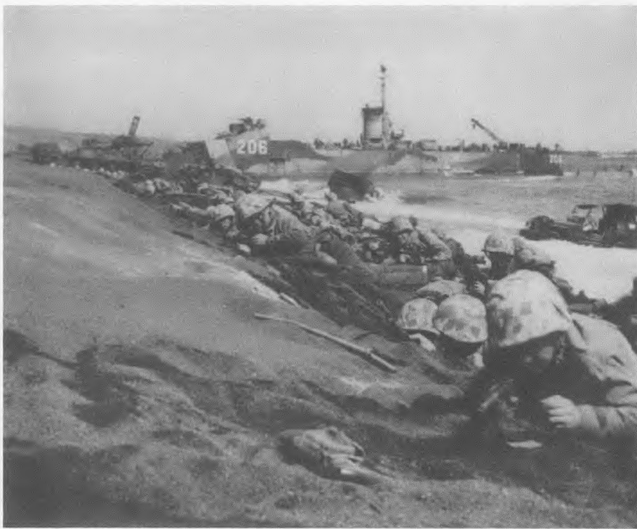
Fourth Division Marines are pinned down on the beach on D-Day, Feb. 19, 1945.