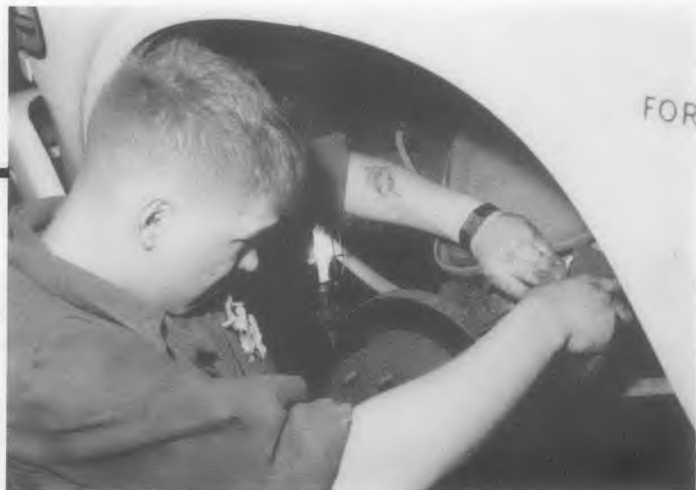
Skilled Mechanics back up the Motor "T" sections' drivers.