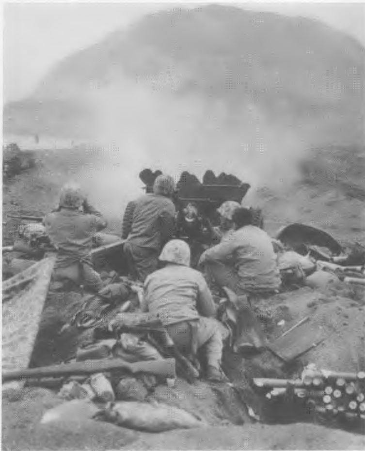
Marines fire a 37mm gun at Japanese positions on Mt. Suribachi.

You hardly ever saw a Japanese; they were all underground. They would wait for the Marine lines to pass by their positions, then they would pop up behind you and take a crack at you. It was like fighting ghosts. The entire time I was there I only saw two or three Japanese, and they were dead or wounded.