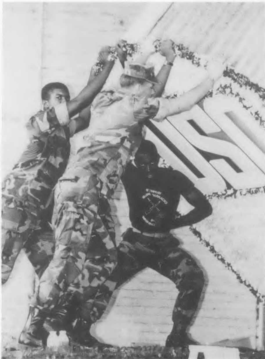
Eighth & I Marines help build a USO parade float.

Although the USO is famous for its overseas shows, the