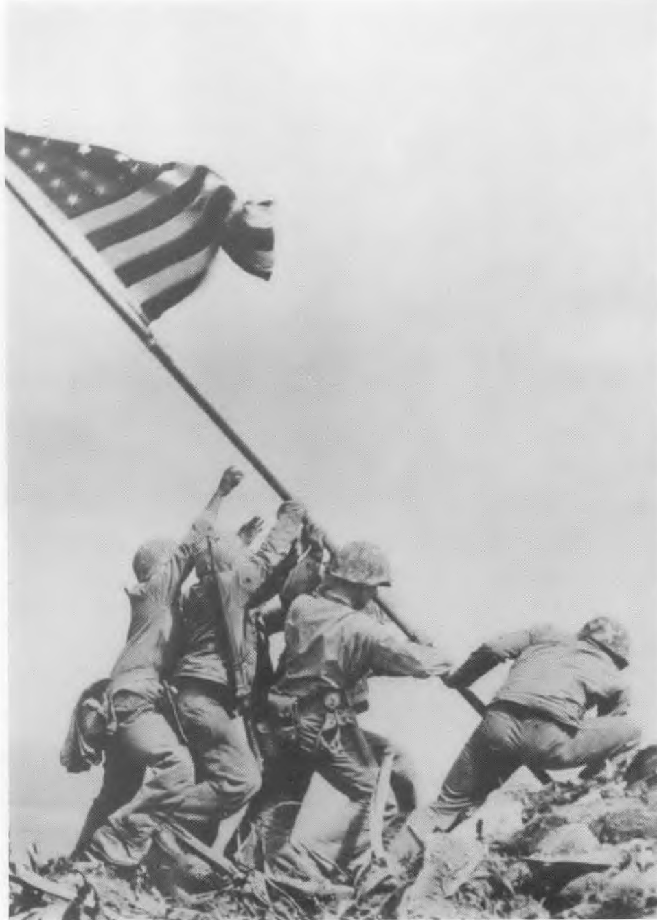
Marines raise the flag on Mt. Suribachi.

PIR: Over 23,000 Marines were killed or wounded and most of Iwo Jima's 21,000 defenders were killed during the battle. Once the airfields were operational over 2,200 disabled B-29 bombers landed on the island which saved the lives of more than 24,000 American fliers. Do you think the cost of the battle in American lives was worth the final