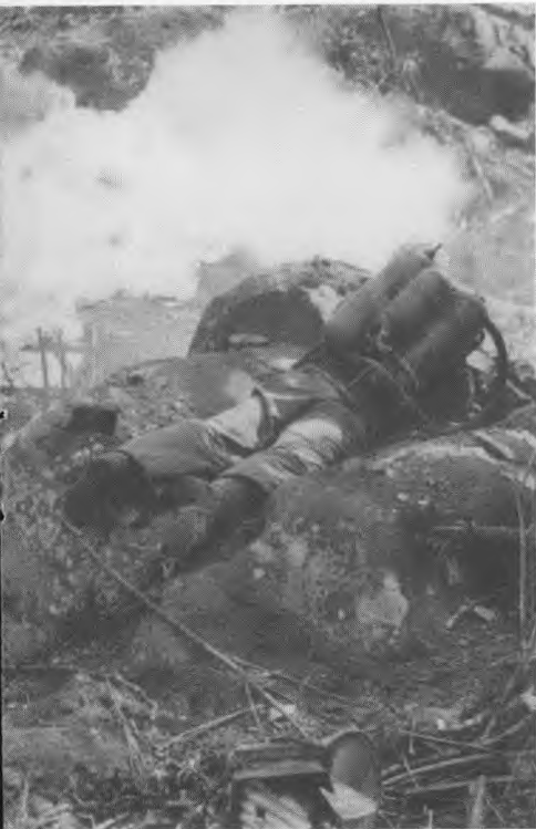
Japanese position into an inferno. photo

American and Japanese Iwo vets for the fortieth anniversary in 1985. It was quite an experience.