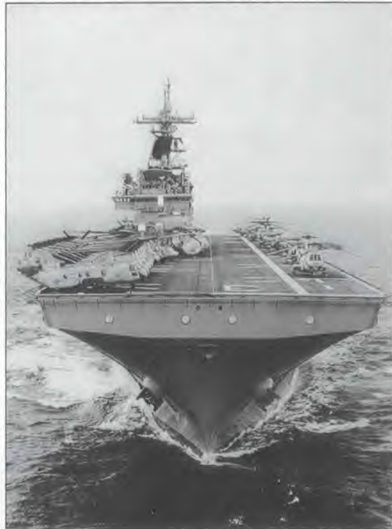
The USS Iwo Jima, the second ship to bear the name, will be similar to the USS Kearsarge, LHD 3 (shown above), when it is completed in 2000.

The assault support system aboard a Wasp-class ship coordinates movement of troops, cargo and vehicles. Monorail trains transport cargo and supplies from storage and staging areas throughout the ship to a well deck, which opens to the sea through huge gates in the ship's stern. There, cargo, troops, and vehicles board the landing crafts for transit to the beach. Air cushioned landing craft can "fly" out