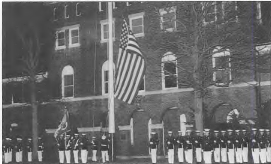
Marines lower the colors during a Friday Evening Parade.

Tattoo, slang for "tap toe," is a Dutch word for turning off the tap on a wine barrel and dates back to the 17th century. At that time, a drummer marched through the streets beating his drum at the end of each day, signaling innkeepers to turn off the taps and stop selling drinks. This encouraged soldiers to leave the inns,