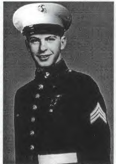
Georgia Governor Zell Miller as a sergeant in the 1950s.

But of all the words used to describe Miller, there is one word that best sums up his achievements and attitude toward success in life — Marine.