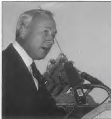
Secretary of the Navy John H. Dalton announced the new LHD during a "Sunset Parade" June 10 at the Marine Corps War Memorial.