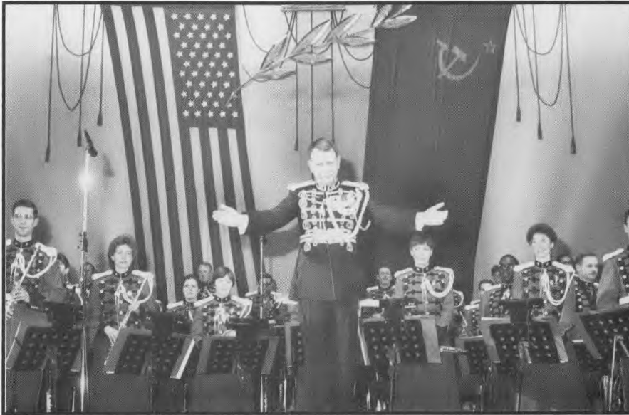
The band receives applause in Leningrad.

II, known in the Soviet Union as The Great Patriotic War. In Minsk, which was nearly completely destroyed in World War II, the band visited several of these sites such as the K h a t y n Memorial-Complex and the Mound Of Glory Monument. Colonel