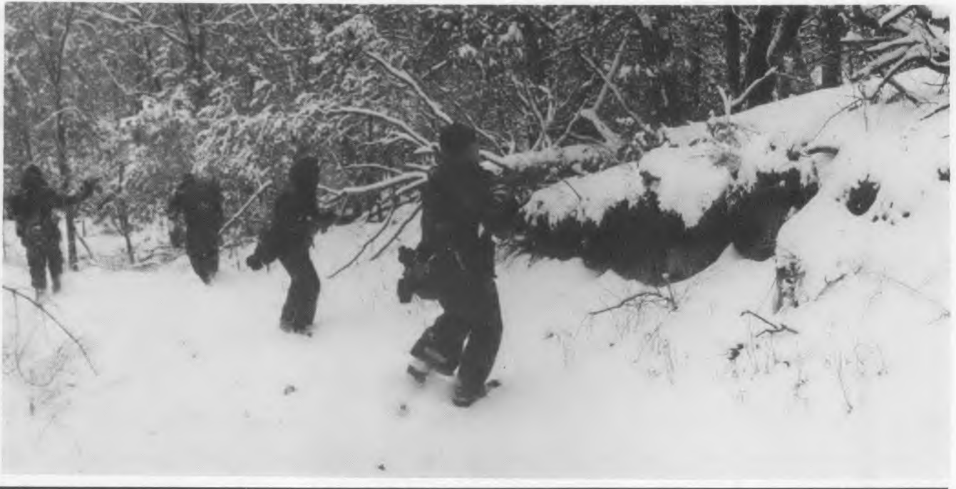
A snow-filled gully serves as cover for some D.C. Marines.