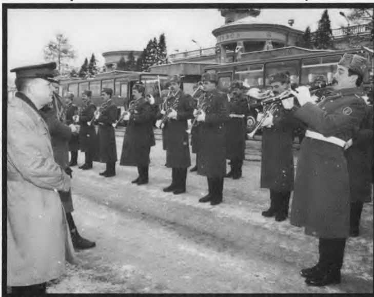
A clarinetist performs for the band before leaving L'Vov.