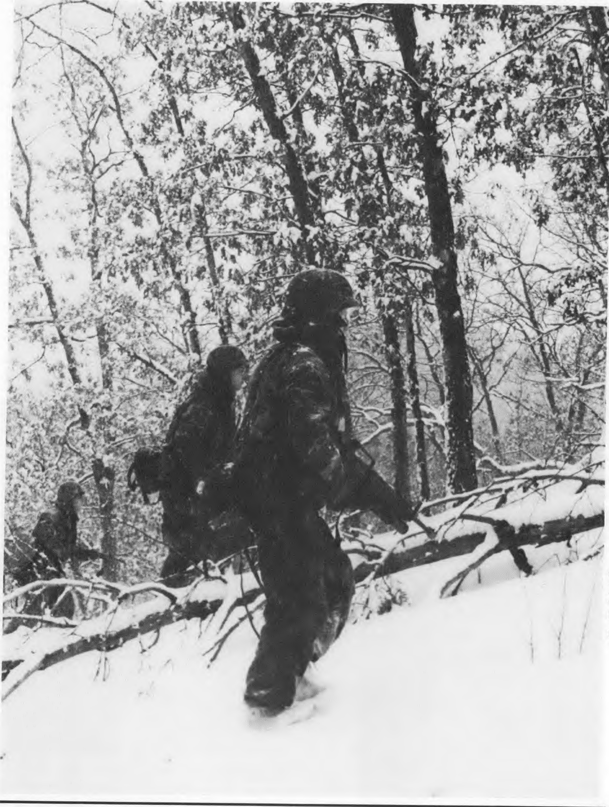
Barracks Marines prepare to repel an assault by 2/24.