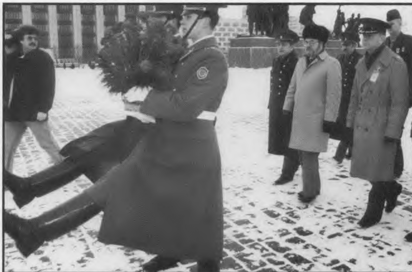
The band paid their respects to Soviet soldiers of WWII.