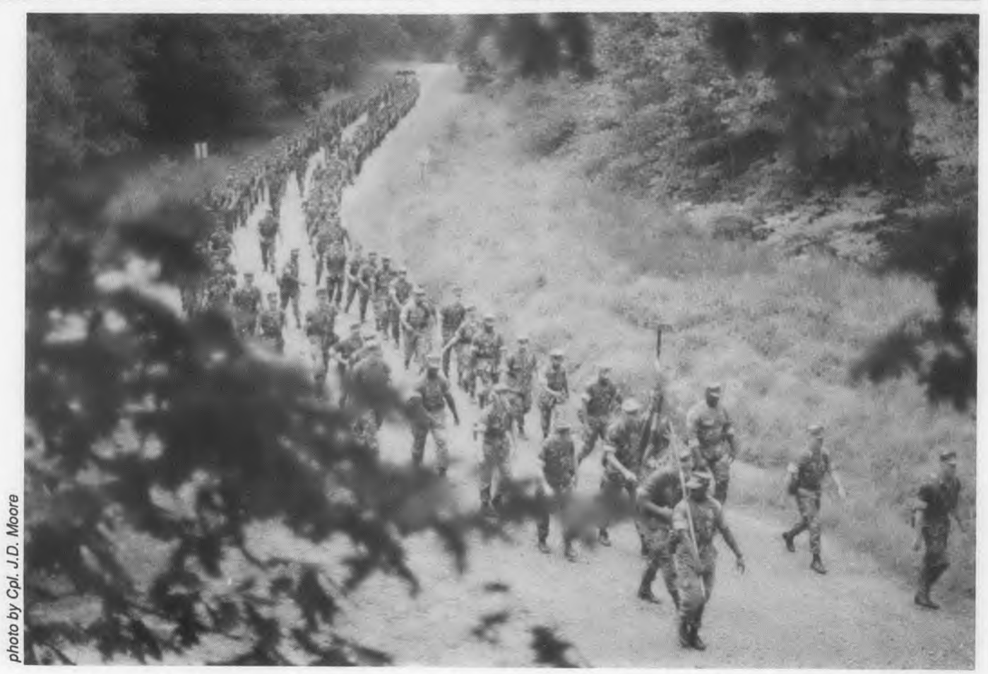
MCI Co. Marines lead the way during a hike at Quantico.