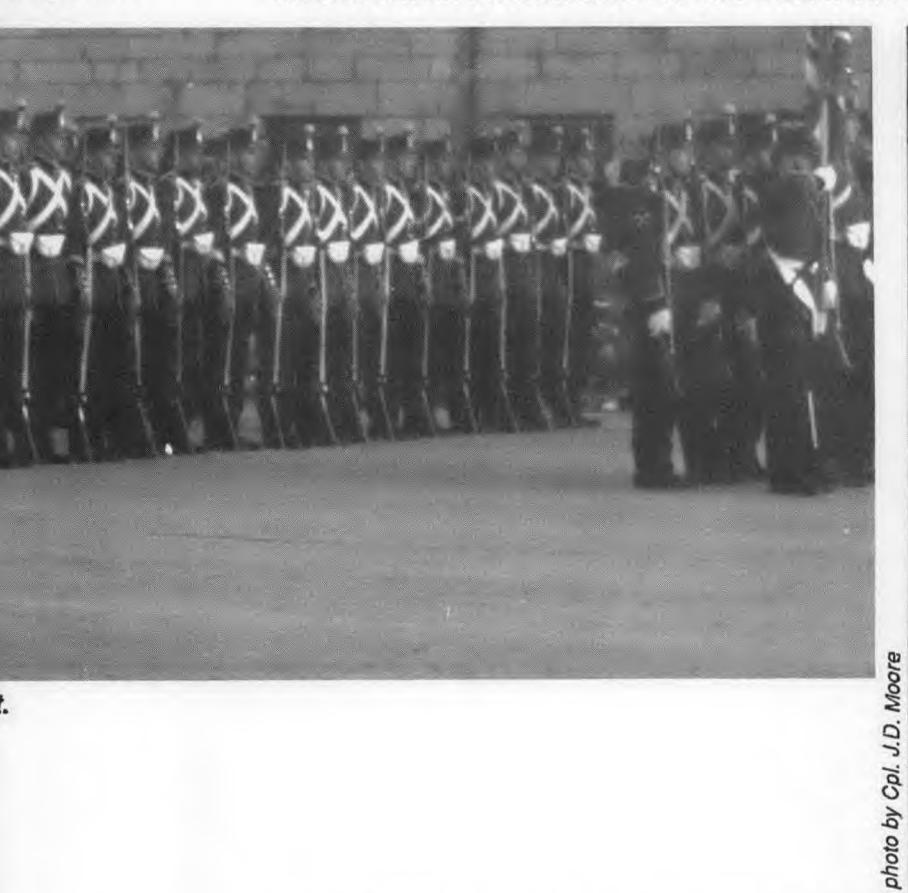
Guardsmen wear the uniforms of 1867 British infantry.