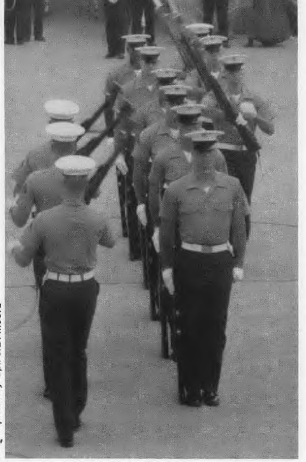
Silent Drill Team goes through the "Meat Grinder" during a joint performance at Fort Henry.