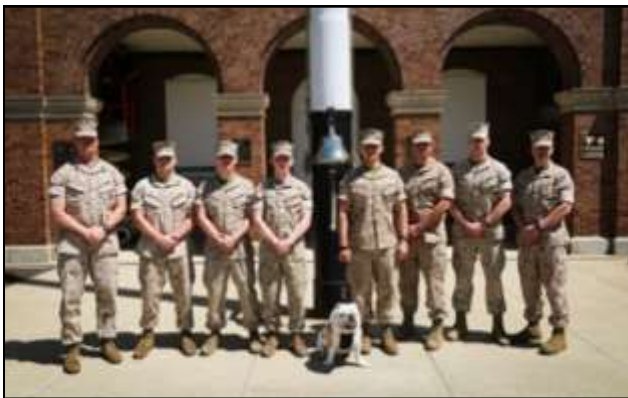
Outgoing Barracks Marines pose for a photo during the April farewell social.