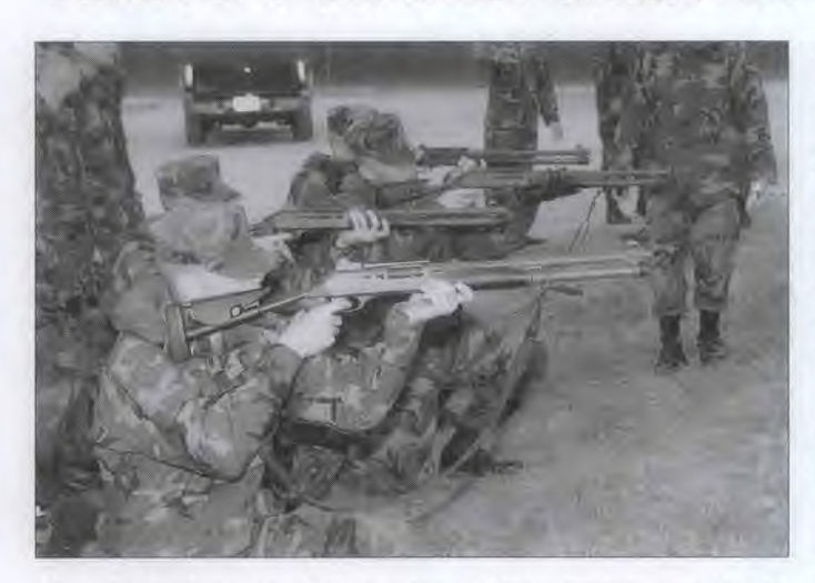
Guard Marines receive familiarization training with the M1014 Joint Service Shotgun.