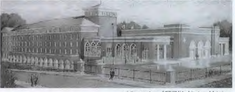
painting courtesy of BBGM/Architects and Interiors

The complex will contain office spaces and a rehearsal hall for the United States Marine Band, in addition to living quarters for 322 enlisted Marines, a parking garage, and an outdoor recreational area.